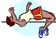
Track & Field